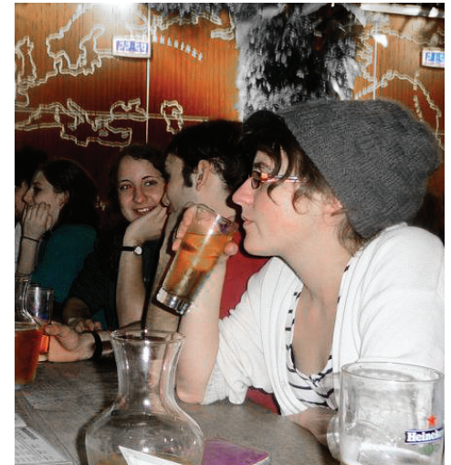
Members of the ASNC Society enjoy Cidre de Bretagne

Funding for master-classes and a field school in the Orkneys for PhD students and early-career researchers in Old Norse and Viking studies has been granted by the AHRC to a consortium of four universities (Cambridge, Oxford, Nottingham and the University of the Highlands and Islands). The skills training programme, 'Extending Academic Research about the Viking Diaspora and its Heritage in the British Isles', will take place in 2013 and will involve archaeologists, historians, museum curators and researchers in related fields.