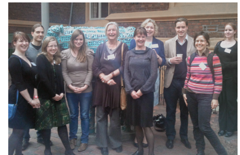
Some present and former ASNCs in Bergen, Norway