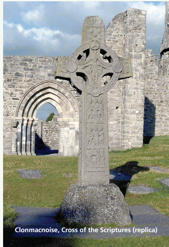
Clonmacnoise, Cross of the Scriptures (replica)

Her project is entitled 'The End of the World? Apocalyptic Expectation in Eleventh-Century Ireland', and it focuses on the so-called 'great panic' of 1096, when Irish chronicles report a moment of panic among certain people who believed that the world would end imminently, and that this could only be averted through prayer, fasting and penitence. By examining 1096 within the wider historical context of religious thought in medieval Ireland, but also – crucially – within the wider European context of the social upheavals of the 1090s, Lizzie hopes to show that apocalypticism was actually very rare in medieval Ireland, as elsewhere, and that most religious writings attest to Irish Christians holding the same eschatological beliefs (that is, beliefs about Judgement Day, heaven and hell) as most other peoples throughout western Christendom. This project grows out of another, recently concluded at University College Cork, with which Lizzie was also associated, namely ' De finibus : Christian Representations of the Afterlife in Medieval Ireland' ( http://definibus.ucc.ie/ ), funded by the Irish Research Council for the Humanities and Social Sciences.