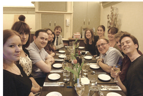
ASNC staff and students, amongst others, at COLSONOEL