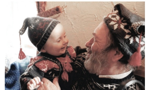
Little Nell and her Grandfather