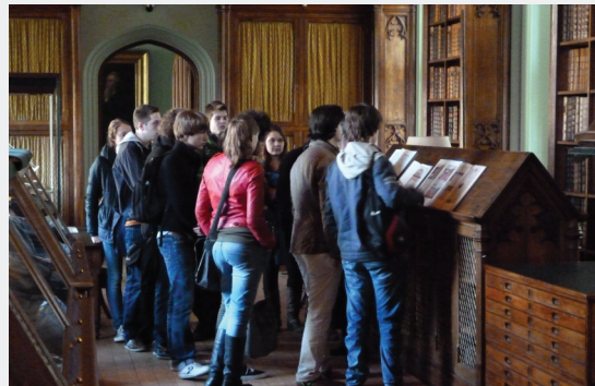
Students viewing manuscripts in the Parker Library